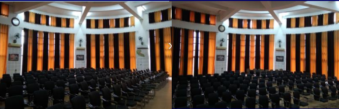
Inside views of Auditorium Hall

The Institution of Engineers (India), Jammu Local Centre has created facilities at Institutional Complex, Sector - 3, Channi Himmat, Jammu which comprises of Bharat Ratna Sir M. Visvesvaraya Centre for Arbitration & Conciliation- Domestic & International", 01 No. AC Auditorium and 06 Nos. AC Double Bed Rooms. In addition to this, there is an Air Conditioned library which can be used by the AMIE students and other engineers of this region for consulting the latest technical books for updating their knowledge.