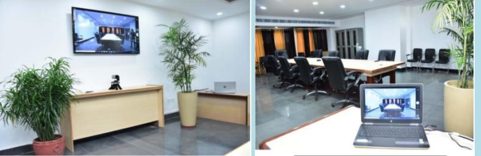
Inside views of Bharat Ratna Sir M. Visvesvaraya Centre for Arbitration & Conciliation- Domestic & International"