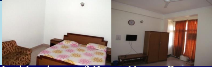
Inside views of Guest House Rooms